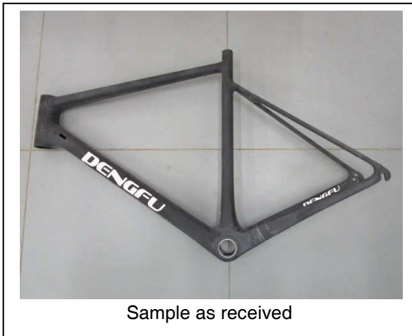
Sample as received