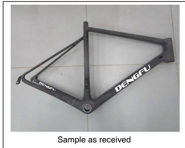
Sample as received